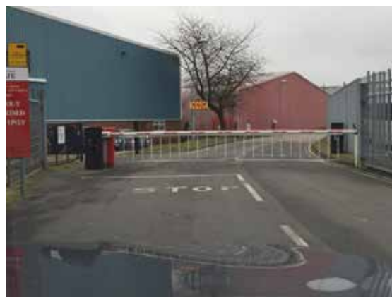
First security barrier

Post code: TN16 3BN – This will get you to the general vicinity. From the roundabout on Main Road (the A233), situated just south of the airfield, enter Churchill Way (see Red Circle on map above). Continue ahead on this road for exactly 1.2 miles after leaving the roundabout. Initially you will pass a large grey hangar on your left. Shortly after, you will come to the first security barrier . This will open automatically when you are in close proximity. Continue ahead, over some minor speed bumps, to the second security barrier which will also open automatically. Follow the road through a wooded area and keep on going till you can go no further. The Biggin Hill Heritage Hangar (blue cladding) will be in front of you. Enter via the glass doors on the left of the building. Contact number: 01959 576767