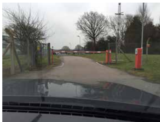
Second security barrier