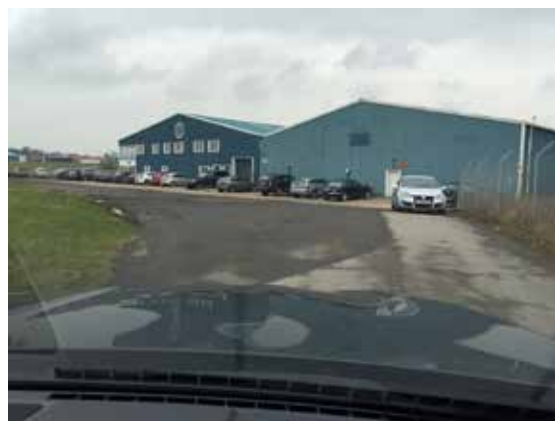
The Heritage Hangar